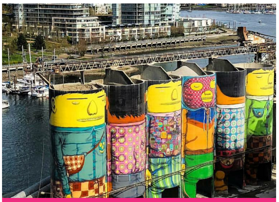
#9 - GIANTS - OSGEMEOS