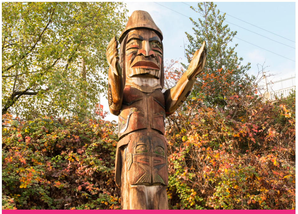
#7 - WELCOME FIGURE - DARREN YELTON