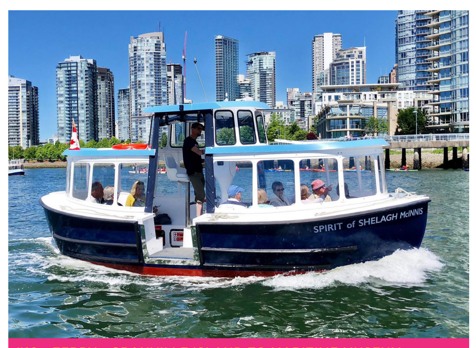
#10 - FERRY - GRANVILLE ISLAND TO MARITIME MUSEUM

Photo Challenge: Take a selfie with the Giants (with your best gigantic smile, of course!) and tag #VanBiennale in your post or story!