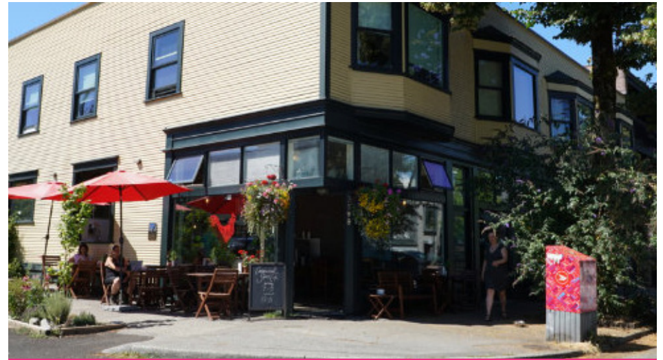
#4 - COMMERCIAL STREET CAFÉ

The Commercial Street Cafe is an independent neighbourhood coffee shop that opened in November 2012 within the historic Gow Block of East Vancouver. A mixed-use wood frame Edwardian structure built in 1910, the Gow Block used to be an integral part of the community. Over time, buildings fell into ruin. However, with much patience, research, and exactitude, Jerry Prussin and Norah Johnson began a complex and lengthy renovation process, resulting in a beautiful restoration and five new townhomes behind the Gow Block.