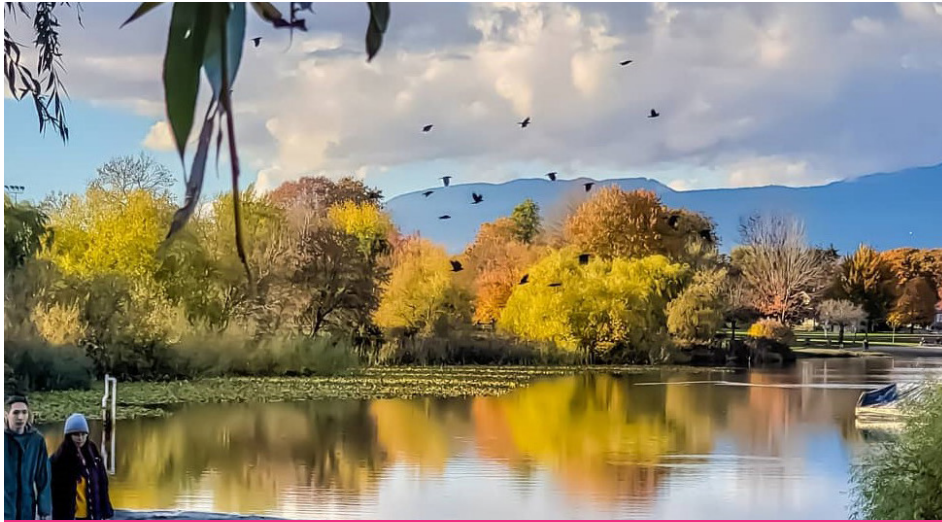
#5 - TROUT LAKE

It's not surprising that John Hendry Park is such a popular destination: tranquil Trout Lake and a wide range of active and passive recreation opportunities create an exceptional setting in the heart of East Vancouver. The beach area (south end) and wildlife habitat around the lake can almost make one forget that that the park is in the city, especially when hundreds of paper lanterns illuminate the vicinity during the annual lantern festival.