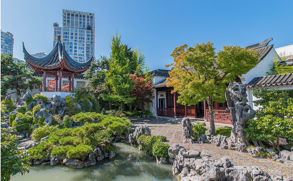
#9 - DR. SUN YET SEN CLASSICAL CHINESE GARDEN

Dr. Sun Yat Sen Classical Chinese Garden is a registered museum and one of Vancouver's top tourist attractions. This Ming Dynasty-style garden-home is the first among its kind to have been built outside China, and continues to be unique in the world as the result of the joint collaborative effort of community members, the Canadian government, and the People's Republic of China.