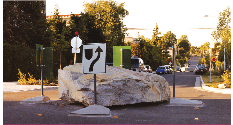
#6 - SUPERNATURAL - SHAUNA GILLIES-SMITH

If you're here on a Saturday, check out the Trout Lake Farmers Market, happening between 9 am and 2 pm from May 1 to October 30 at 13th Avenue and Lakewood Drive!