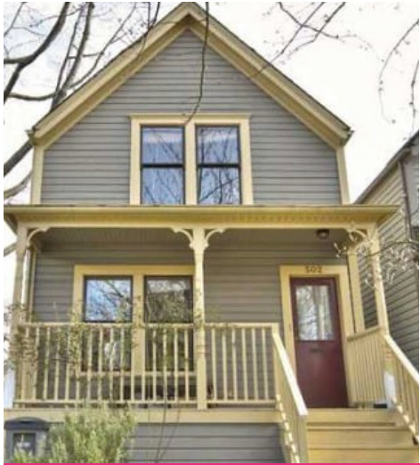
#3 - VERNACULAR AND EDWARDIAN ARCHITECTURE

Early Vernacular architecture (left) , typically built between 1870 and 1910, began as a single-story gabled roof home with a shallow porch leading up to a front door. As construction processes improved, Early Vernacular homes transformed into two stories, having a full-length pitched roof and bay windows.