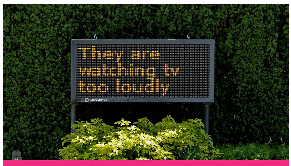
#6 - VANCOUVER NOVEL

Vancouver Novel João Loureiro 2014 - 2016 Vancouver Biennale