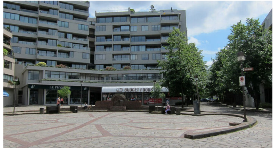
#6 - LEG IN BOOT SQUARE

DID YOU KNOW . . . that False Creek used to extend east to Clark Drive, approximately 4 km from the Cambie Bridge? With massive infill projects significantly altering the shape of False Creek, the artists believe that the artwork's location furnishes opportunities for reflections on Vancouver's shoreline. In the artists' words, the "scale of the engineering of False Creek and the Cambie Bridge, along with the scale of potential future environmental change, are made visually and physically palpable, yet the experience takes on an aesthetic related to philosophical concepts of the sublime."