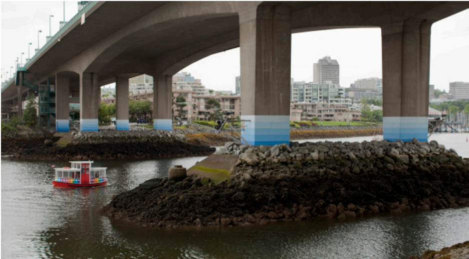
#5 - A FALSE CREEK - WANDA WEPPLER AND TREVOR MOHVSKY