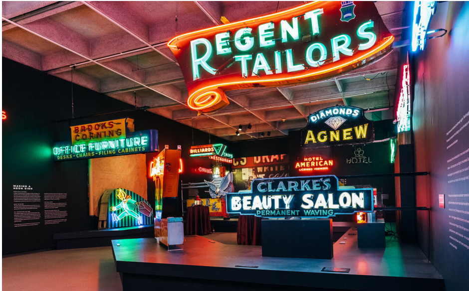
#13 - MUSEUM OF VANCOUVER

The Museum of Vancouver (MOV) connects Vancouverites to each other and connects the city to the world. An enthusiastic civic advocate, MOV is dedicated to encouraging a deeper understanding of Vancouver through stories, objects and shared experiences. MOV is an independent, non-profit organization that seeks partners to support the evolution of the Museum's visitor experience.