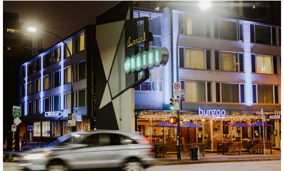
#14 - FINISH - NEON K(NIGHT) RIDE / THE BURRARD

The remarkable signs, some lit for the first time since they were rescued from the junk yard, are accompanied by the tale of how the city went through a war of aesthetics that resulted in a transition of how Vancouver imagines itself.