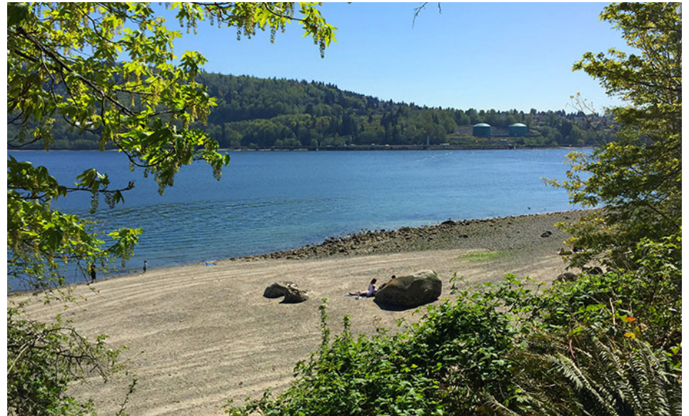
#12 - CATE'S PARK

Telling a story that is deeply rooted in the history of the land and the Tseil-Waututh people, the Story of Creation house-post, hand-carved from old-growth western red cedar, depicts the transformation of man through the love and power of the wolf spirit.