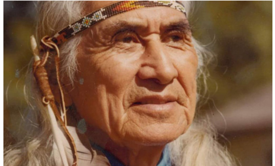
#9 - CHIEF DAN GEORGE EXHIBIT AT MAPLEWOOD FLATS

Located at the entrance to Lynnmouth Park and connected to the Spirit Trail, Swale depicts a long ocean canoe floating over an extension of oars propelled forward by the efforts of a single young canoeist. Captured within the tension of the moment are our hopes for tomorrow as a new generation takes the oars.