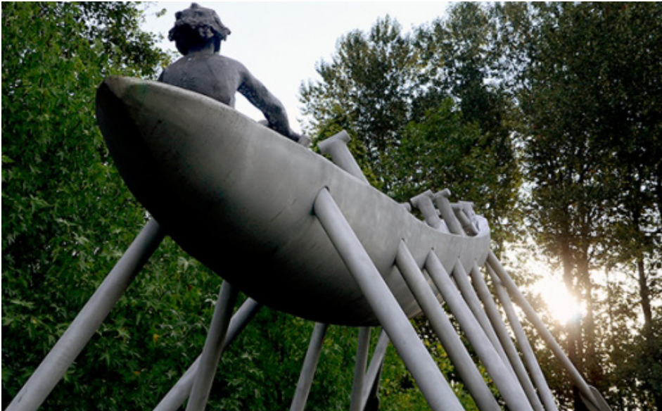
#8 - SWALE - VERONICA AND EDWIN DAM DE NOGALES